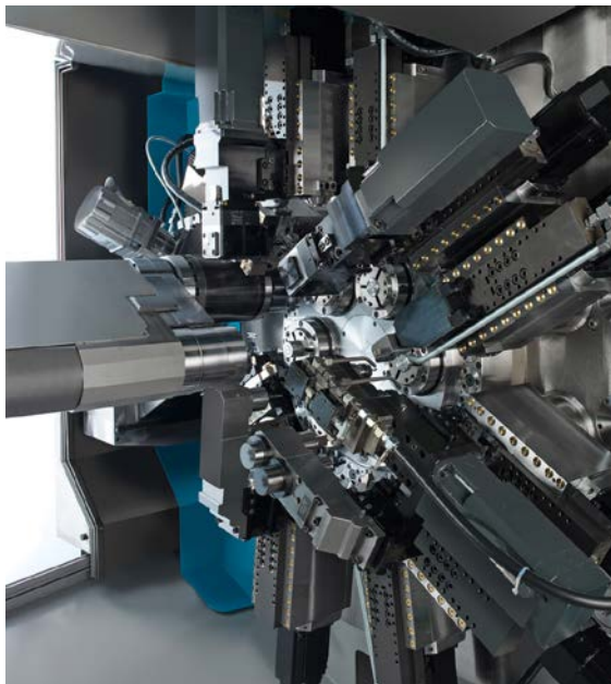
Figure 2: Flexibility with system: Different tools for different machining operations per spindle position can be installed on the cross- slides.