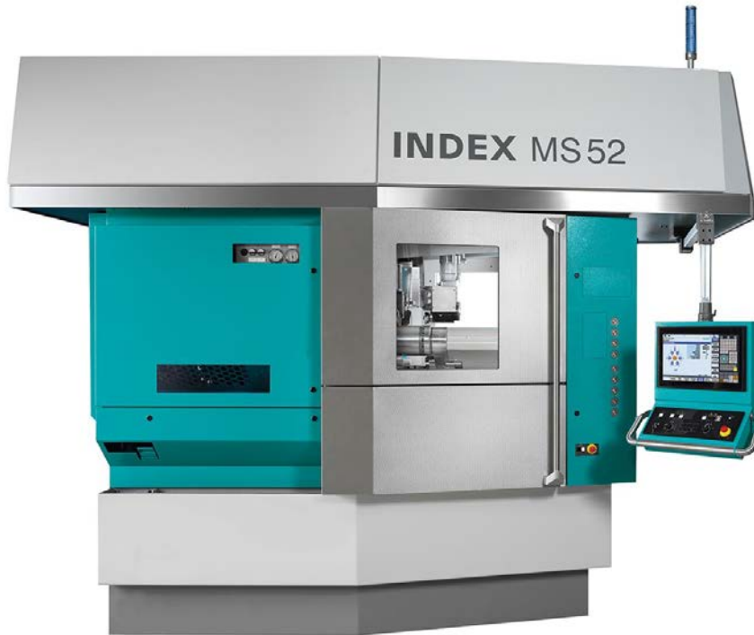
Figure 1: The INDEX MS52C