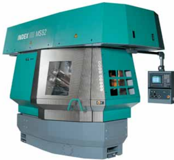
Pic 1: INDEX MS52C