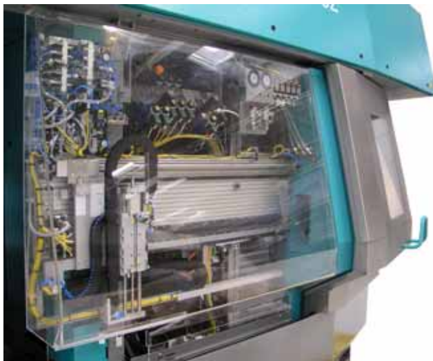
Pic 2: The modular handling system