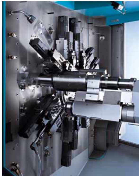
Figure 2: With the MS22C lean, backworking is possible with 3 fixed tools.