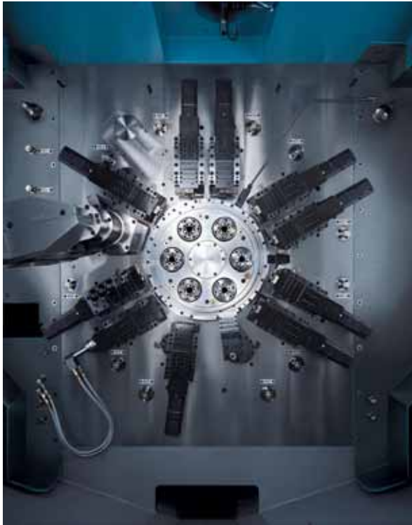
Figure 1: Due to the firmly pre-defined equipment range of the version MS22C lean and the limitation to 31 NC axes, the machining of simpler turned parts at lower costs is possible.