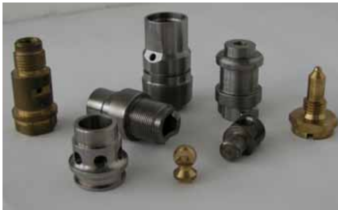
Figure 4: Less demanding than the workpieces that have been machined until now on CNC multi-spindle automatics, but produced at the same piece cost as when using cam-controlled machines: exemplary workpieces for MS22C lean