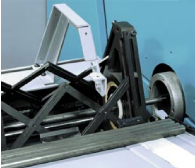
Bearing plate lattice grate construction as anti-friction-guided bar supporting unit for acceptance of a bar