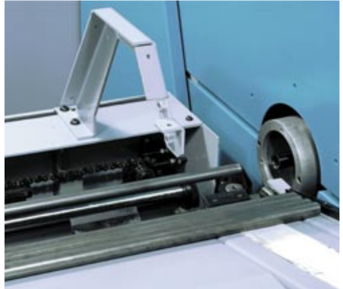
Bar stock with stop rail and supporting prism