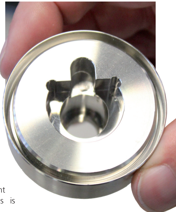
Top image: After the turning, live tools in the turrets start the milling so that parts come out of the machine completely finished.