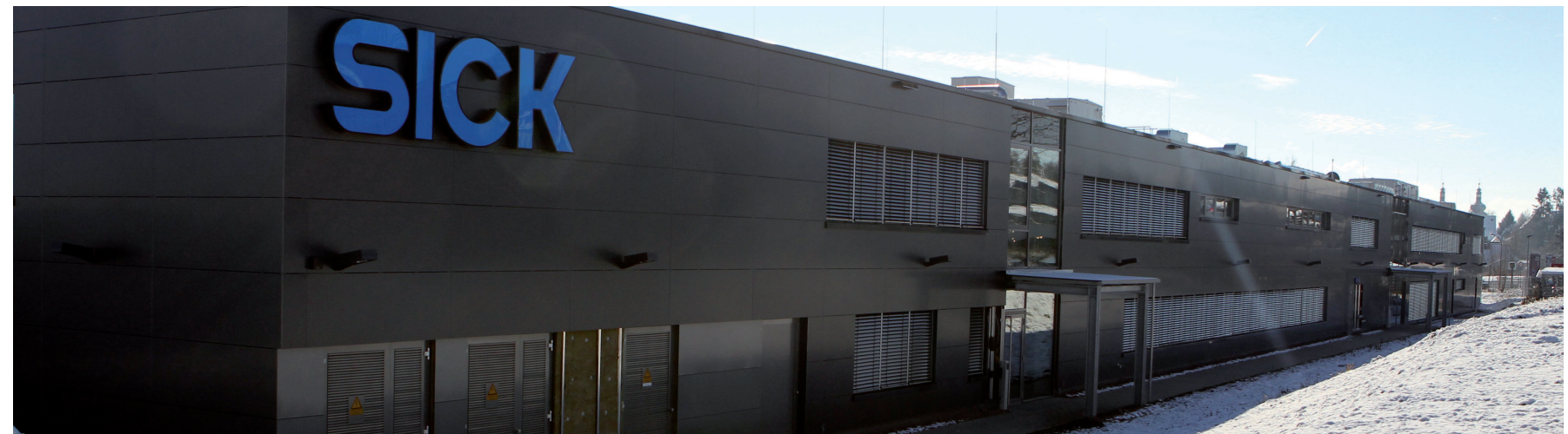
The new product building in Donaueschingen